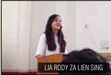
LIA RODY ZA LIEN SING

June 18, 2016 (10.30am to 3.30pm) in “Hon Pheklek In” (Ps 139: 23a)