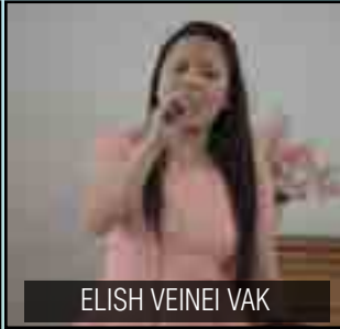
ELISH VEINEI VAK