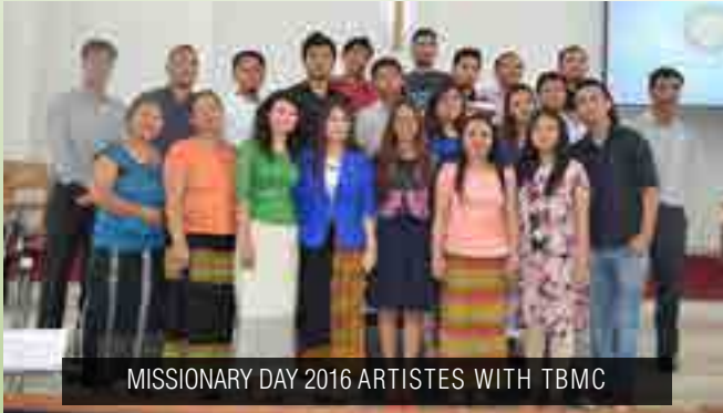
MISSIONARY DAY 2016 ARTISTES WITH TBMC

akipan in leng lasa siam bangzah hiamte chial ahi. Hiai in i missionary masate leh Kros Sepaih muanhuai te tanchin theihthakna hon pia in, lungkhoih mahmah hi.