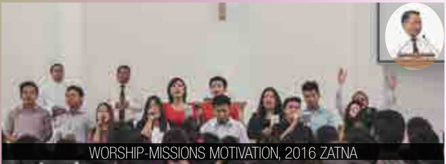
WORSHIP-MISSIONS MOTIVATION, 2016 ZATNA

TBMC in tukum (2016-17) in meeting 10 vei kinei in, Missionary Ginna thuchiam (Pledge Card) hawmna khat vei kinei hi. Saptuam in Ministry Year Plan 2016-2017 a Missions toh kisai a naa guan omte semsua hi.