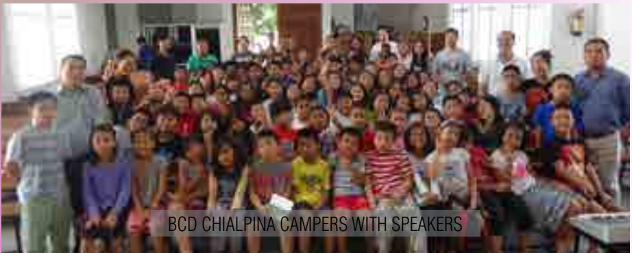
BCD CHIALPINA CAMPERS WITH SPEAKERS