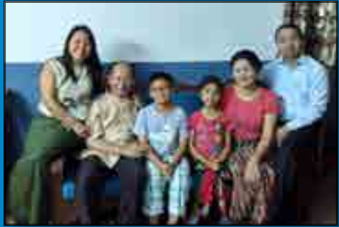
PU LB MUAN (REBUILD AND RESTORE) IN WORSHIP TEAM TE THA APIAK LAI