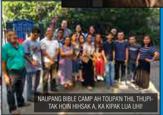
NAUPANG BIBLE CAMP AH TOUP'AN THIL THUPI- TAK HOIN HIHSAK A, KA KIPAK LUA UH!!