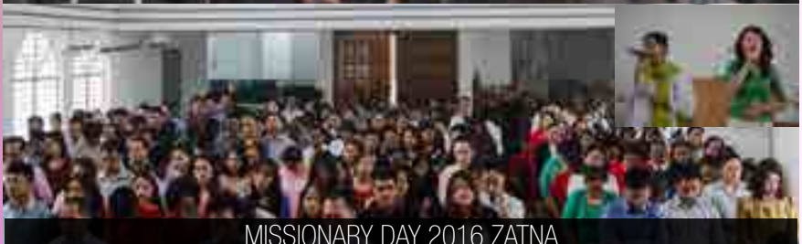
MISSIONARY DAY 2016 ZATNA