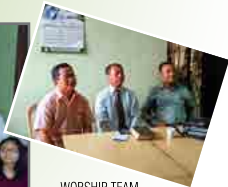
WORSHIP TEAM KITHUAHKHAWMNA